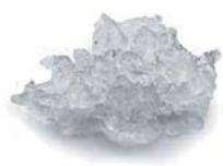
AF 127 Flake ice Residual water content 25%